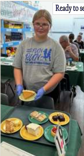
Ready to serve at 18th Street

CONFIRMATION SPONSOR: start thinking about who will be your child's sponsor. Sponsor must have a Letter of Eligibility from the parish where they are registered parishioners (include priest signature and church seal). Call parish office 304-242-6579 if you have questions.