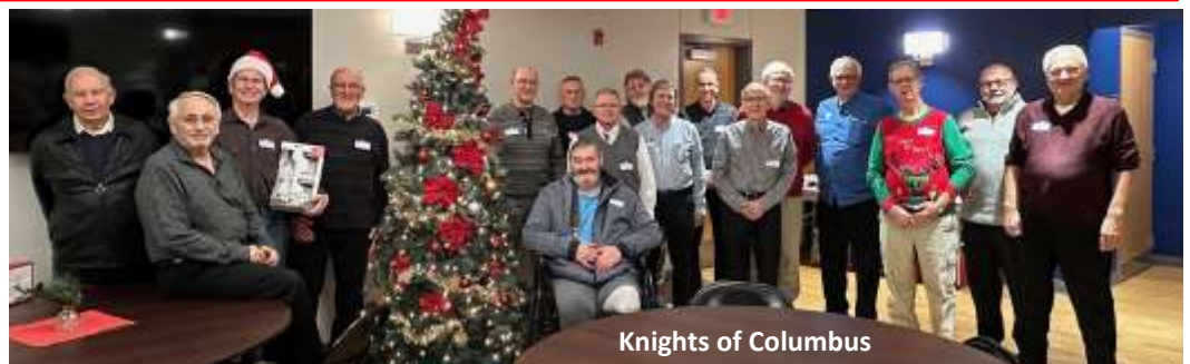
Knights of Columbus