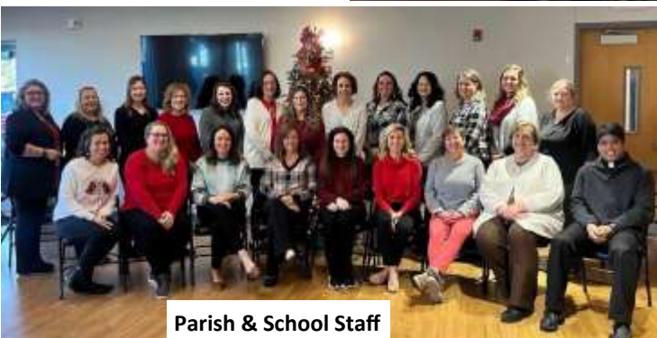
Parish & School Staff