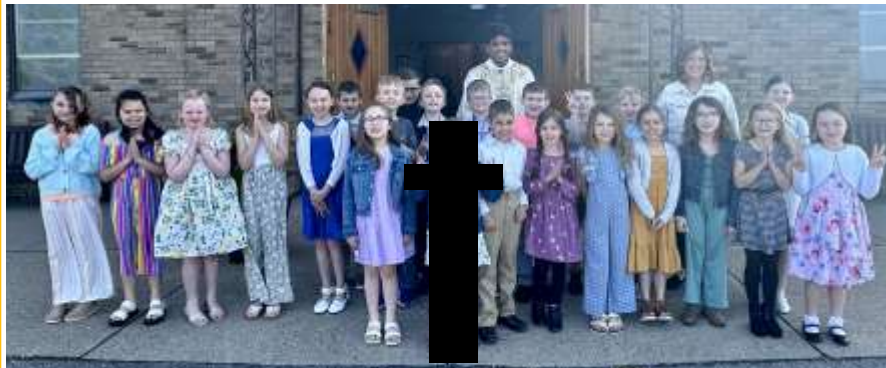
The Body and Blood of Christ