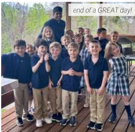
end of a GREAT day!