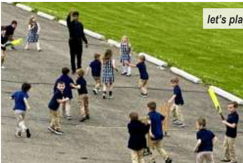
let's play cricket!