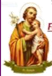
Feast of Saint Joseph March 19

We are again coordinating a sit-down dinner for those who regularly have their supper at Catholic Charities 18th Street Neighborhood Center. Last year we served over 70 baked