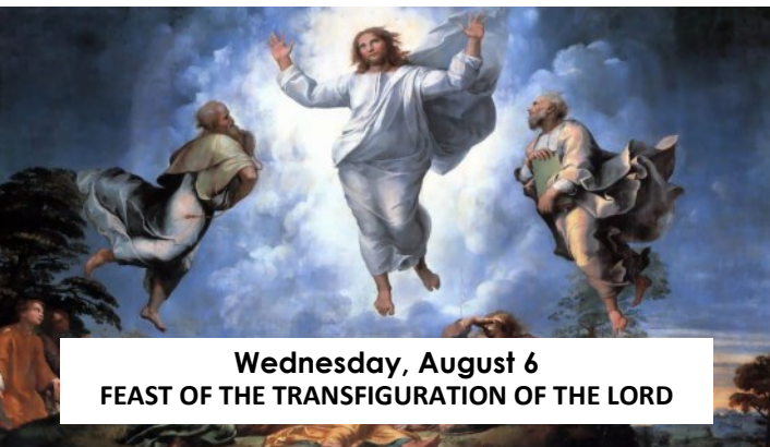
Wednesday, August 6 FEAST OF THE TRANSFIGURATION OF THE LORD