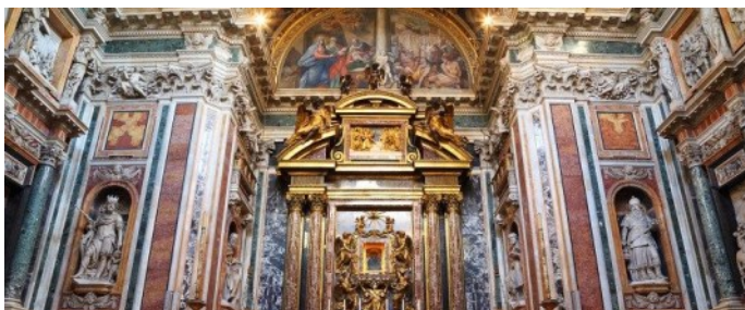
Tuesday, August 5 The Dedication of the Basilica of Saint Mary Major

Questions? Contact parish @olpww.org or call 304-242-6579