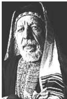
The CHOSEN SHABBAT

"I don't understand it myself. I was one way and now I'm completely different. And the thing that happened in between—was Him. So yes, I will know Him for the rest of my life."